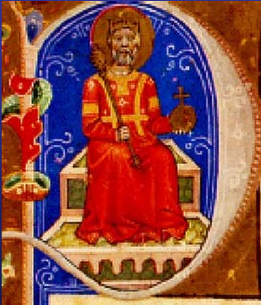
St. Stephen (970-1038)

Established 896, The first Christian King was coronated in 1001.