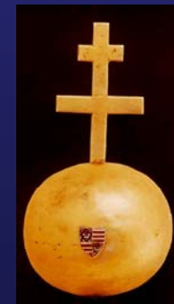
Hungarian coronation jewels